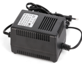
AC24V/3A Power Supply