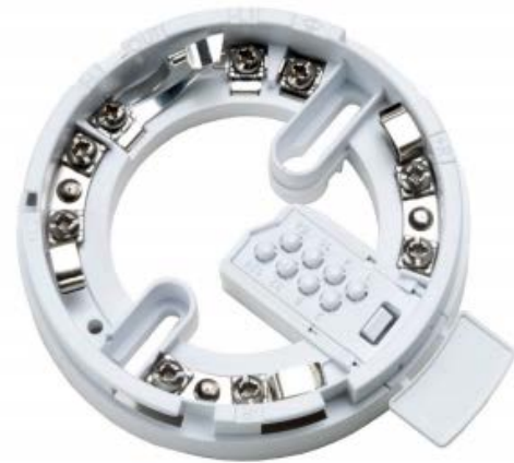
Figure 1. Essentia intelligent mounting base EBE200-N

The Essentia intelligent mounting base EBE200-N has wide interior diameter for ease of cables and terminals. Isolated and non-isolated devices are supported. Mounting base is keyed to accept only addressable devices. The detector can be locked to the base. It's backward compatible for Intellia detector ranges.