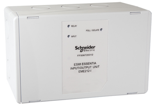
Figure 1. Essentia intelligent input/output unit EME212-I

There is a DIL switch for address setting. Address range is 1-126.