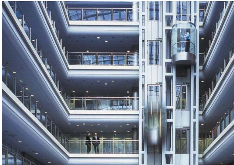
SiPass Access Control System